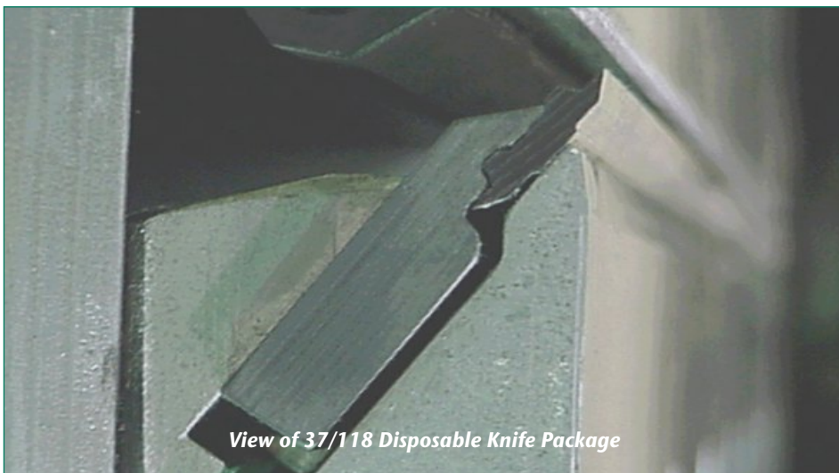
View of 37/118 Disposable Knife Package