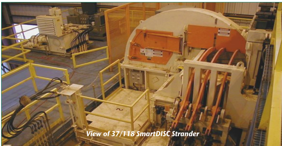
View of 37/118 SmartDISC Strander