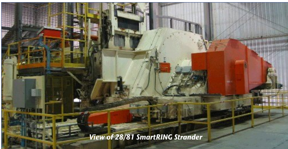
View of 28/81 SmartRING Strander