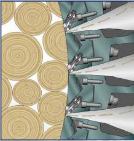
Typical Stranding Action