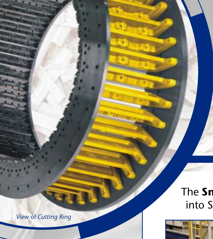
View of Cutting Ring

The SmartRING Strander cuts tree length or shorter logs into Strands for Oriented Strand Board (OSB) production.