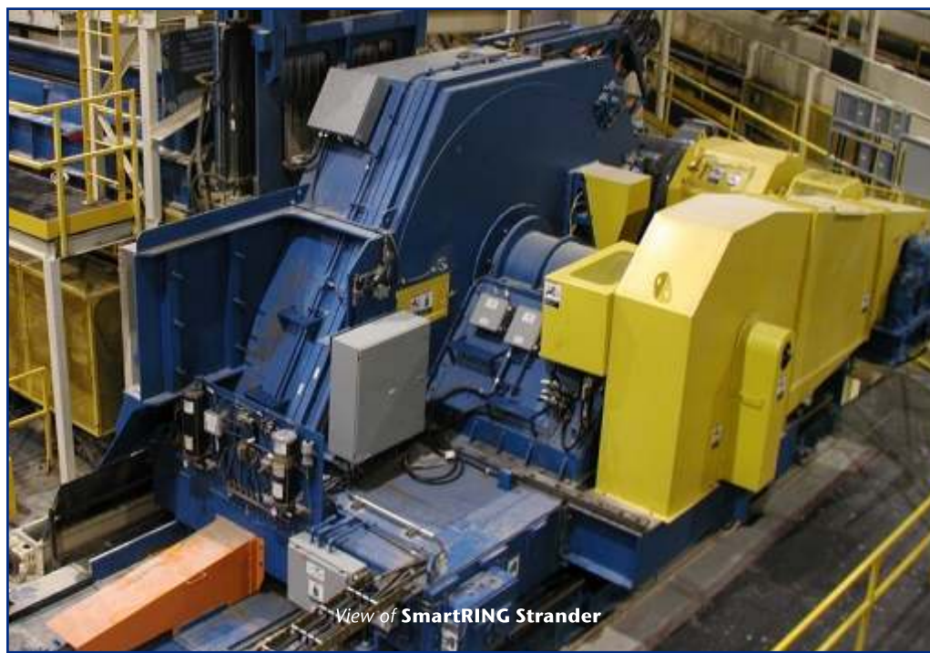
View of SmartRING Strander