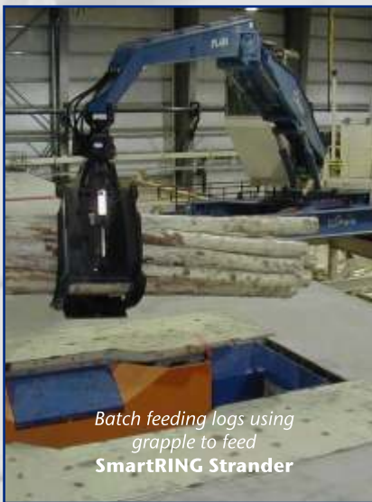
Batch feeding logs using grapple to feed SmartRING Strander