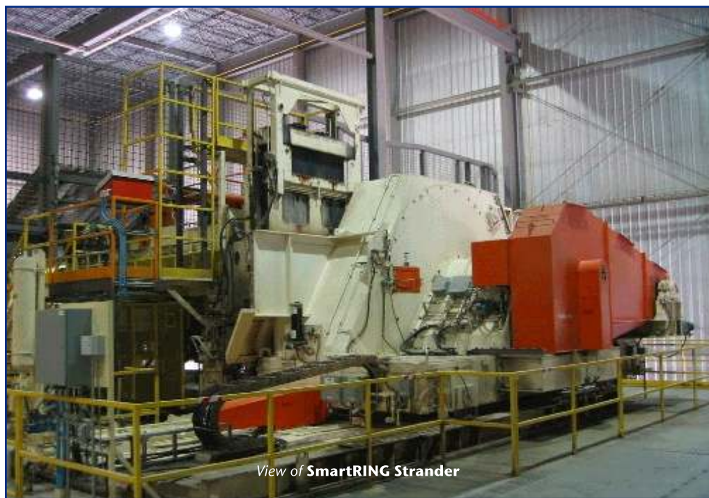
View of SmartRING Strander