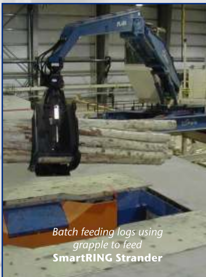
Batch feeding logs using grapple to feed SmartRING Strander