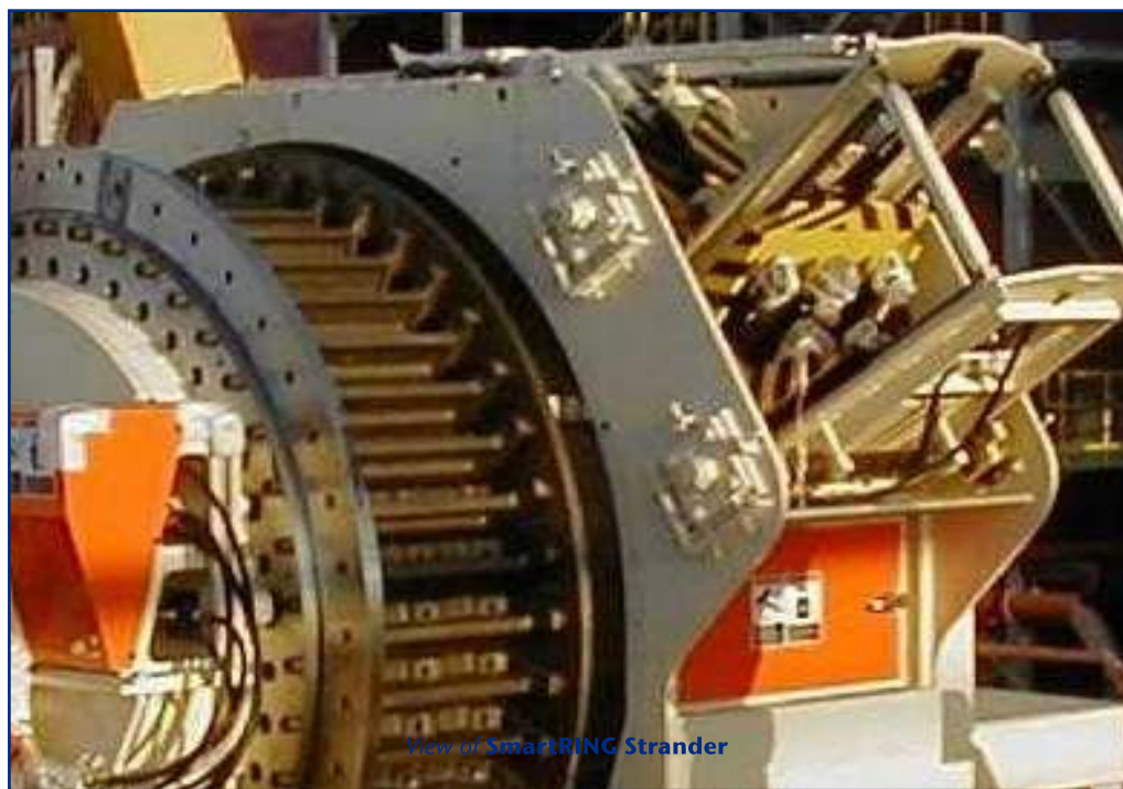
View of SmartRING Strander